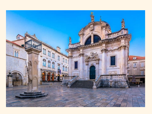
Day 2 - September 27, 2024