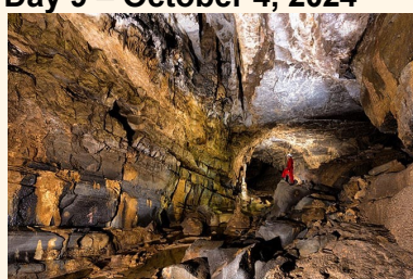
Day 9 - October 4, 2024

Ah, the Adriatic! We have a full day at leisure to savor the city's Austro-Hungarian grandeur, lovely waterfront promenade, and charming cafes and restaurants. Or, consider a delightful optional Istrian Peninsula excursion to see picturesque towns along the stunning coastline. Accommodation: Hotel Paris, Opatija. Meals: Breakfast (B)