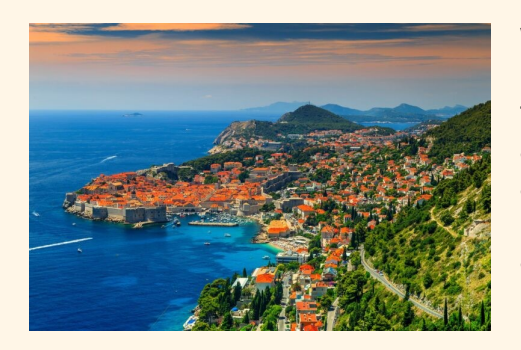
Day 1 - September 26, 2024

Our group air has been canceled due to too few people were interested in these flights. Air flights will vary accordingly.