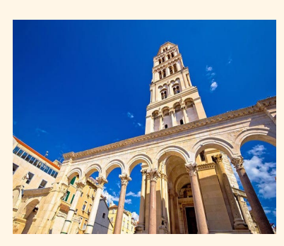
Day 5 - September 30, 2024

Enjoy a full day of leisure in Dubrovnik, described as the "pearl of the Adriatic." Consider browsing in a colorful local market or consider an optional Full Day Tour. Accommodation: City Hotel Dubrovnik. Meals: Breakfast (B)