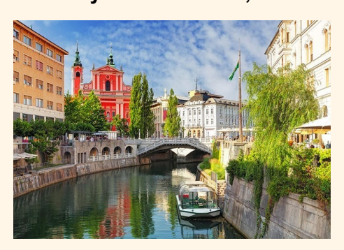
Day 11 - October 6, 2023

An Alpine lake surrounded by high peaks, Bled was "discovered" by travelers in the middle of the 19th century. Since then, a small town of hotels, villas, and restaurants has developed around the lake, turning Bled into a lively, all-seasons resort. Our sightseeing tour features the charming town and the lakeshore and visits the imposing Bled Castle, perched on a cliff high above the lake. The balance of the day is at leisure. Consider joining an optional excursion to the small island in the middle of Lake Bled. Accommodation: Hotel Park. Meals: Breakfast (B)