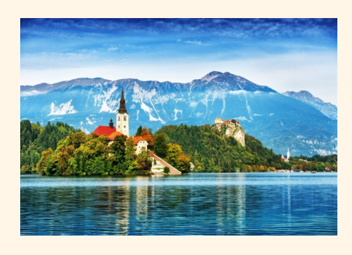
Day 10 - October 5, 2024

Accommodation: Hotel Park, Cesta svobode 15, 4260 Bled, Slovenia Meals: Breakfast, Lunch & Dinner (B, L, D)