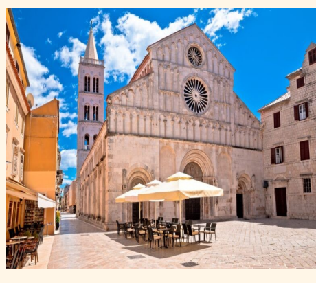
Day 6 - October 1, 2024

Today, we'll depart Dubrovnik and continue along the spectacular Dalmatian coast, breathing in amazing views of palm trees, olive groves, and idyllic fishing villages, before arriving in Split. With its setting nestled between the mountains and the seas, Split is truly picturesque. Our guided tour takes us to one of the most imposing Roman ruins, the third-century palace of Roman Emperor Diocletian. Accommodation: Hotel Corner, Mazuranicevo Setaliste 1, 21000 Split. Meals: Breakfast & Dinner (B, D)